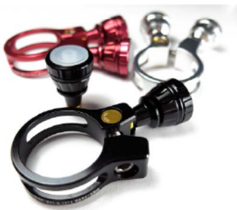
Bolt type, Twin LED