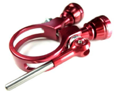
Titanium lever, Twin LED

Material: AL6061 T6, Anodizing color: LED color: Battery: CR1632, Output: 2,000 mcd Runtime: Steady: 20 hrs, Flash: 60 hrs Function: Steady>>>Flash>>>Off All products are water-repellent