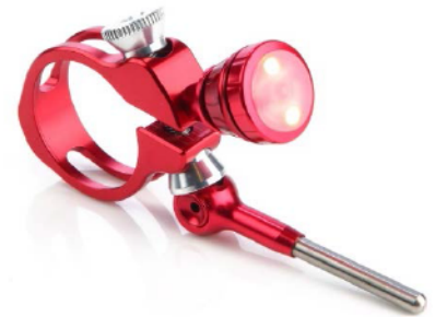
Titanium lever, Single LED