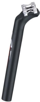
2-Bolt Seat Post