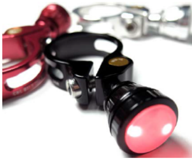
Bolt type, Single LED