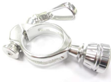
Aluminum lever, Single LED