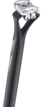
Wedge Clamp Seat Post