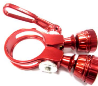
Aluminum lever, Twin LED