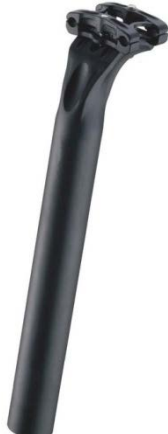
2-Bolt Seat Post